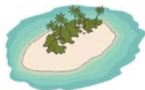
on a desert island